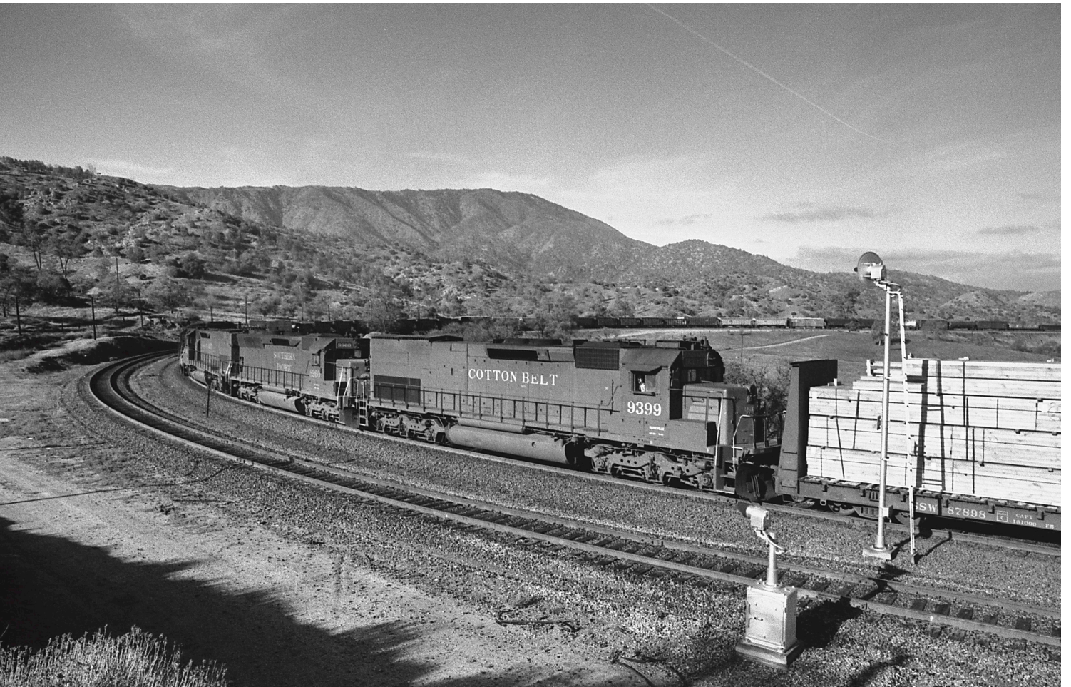
The quintet of SDs entrained two-thirds back will cut-off at Summit Switch.