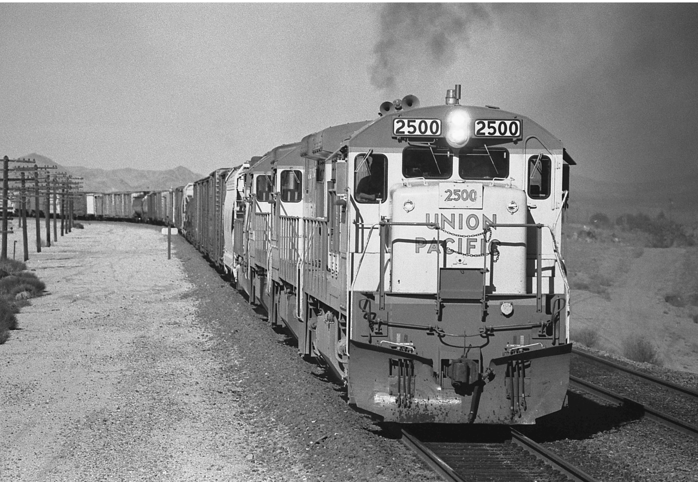
Leading an EMD, three C30-7s darken the skies above Hesperia as they lift westbound tonnage toward the summit of Cajon Pass, 1980.