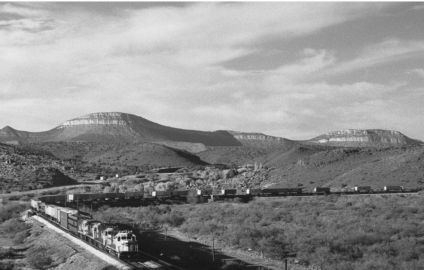
Dropping toward Valentine, Arizona, a westbound rejoins Route 66 at the bottom of Crozier Canyon.