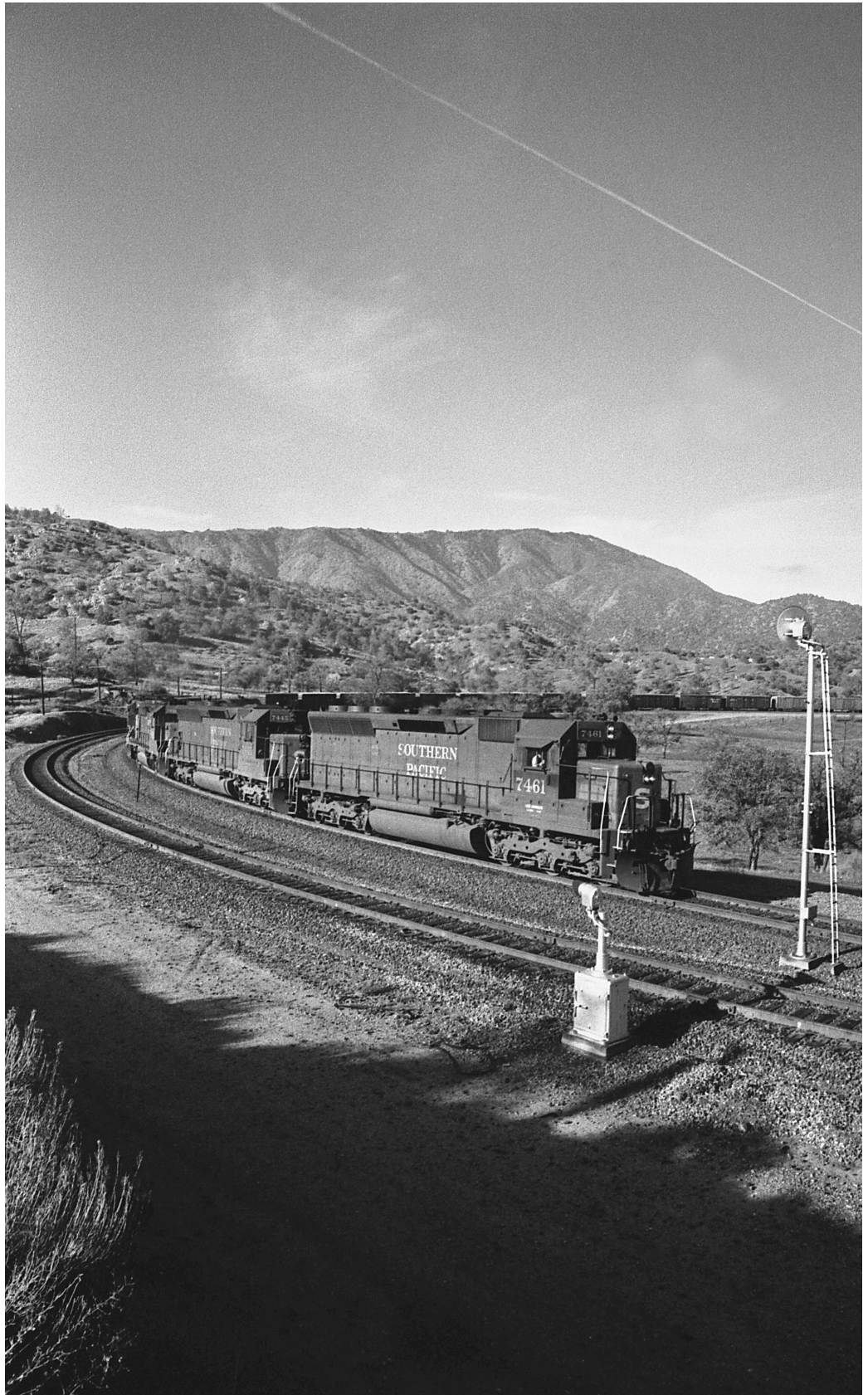
Ladened with lumber from the Pacific Northwest, an eastbound climbs around Tehachapi Loop not long after sunrise.