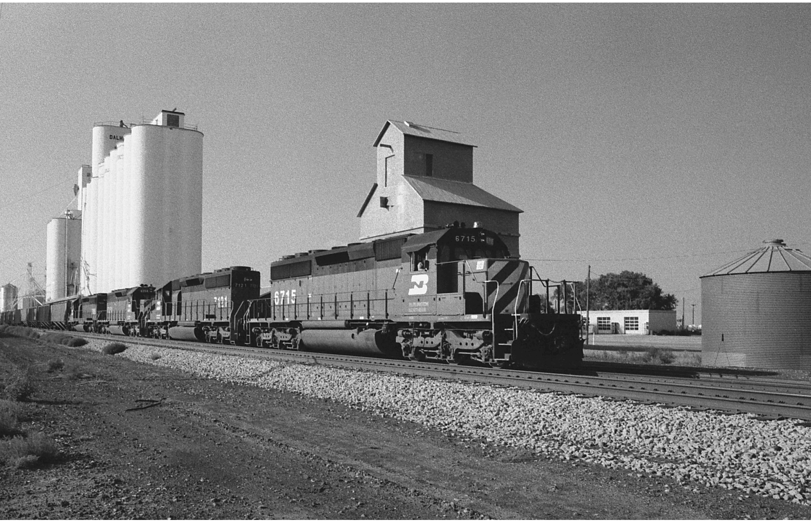
Illuminated by a Texas sunset, a quartet of SD40-2s work eastbound grain through Dalhart, 1989.