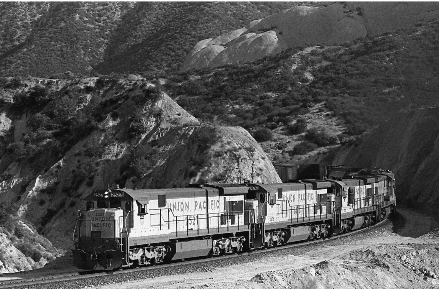
A sextet of C30-7s with an obscured EMD climb Cajon Pass eastbound between Pine Lodge and Alray.